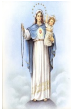
October Month of the Rosary