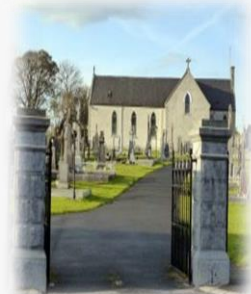
The Church of the Assumption Slieverue