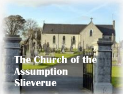
The Church of the Assumption Slieverue