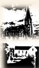
The Church of the Sacred Heart Ferrybank

Website www.ferrybankslieverueparishes.ie